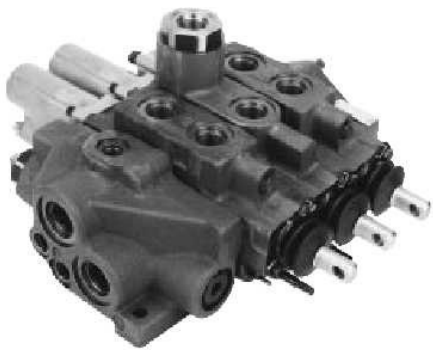
Rexroth MP-18 Stack Valve