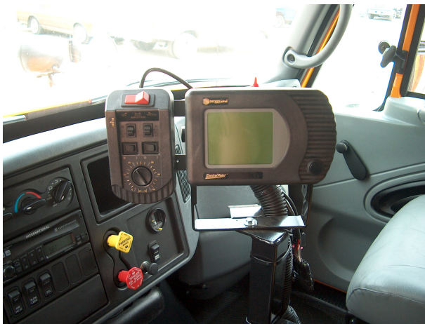
Control Point Module & Display